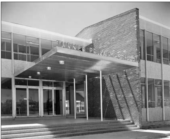
Entrance to Turner School 1957

Becoming positive contributors has been an additional part of our learning focus since 2021 and through understanding the impact on our future, we also acknowledge the history of Ngunnawal culture, Country and peoples as the centre of our place- existing here long before the school building. Turner has an extensive story of becoming learners who are inquirers. Our Turner Learner Profile is highlighted through the festival (and indeed, our regular learning across the year), as we practise being numerate, researchers, thinkers, communicators, collaborators and self-managers of our learning through rich literacy and arts opportunities. All these learning characteristics are leading us to a future where our students are equipped with the skills and capabilities to live, learn and contribute successfully to an ever changing world!