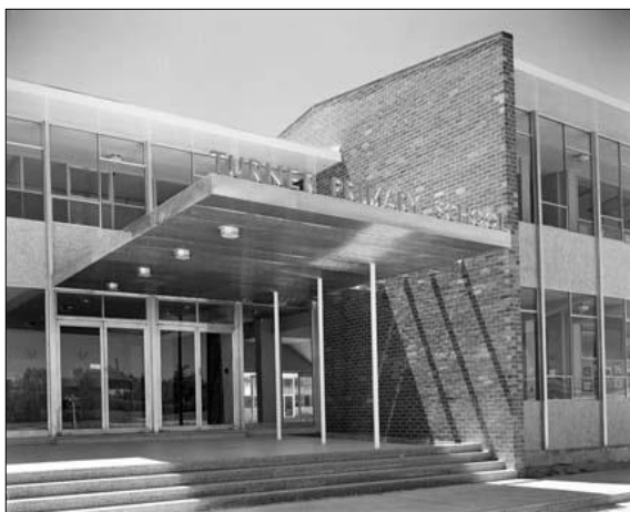
Entrance to Turner School 1957

The school is set in attractive leafy grounds with extensive grassed areas and is conveniently close to the City Centre, the Australian National University and the CSIRO.