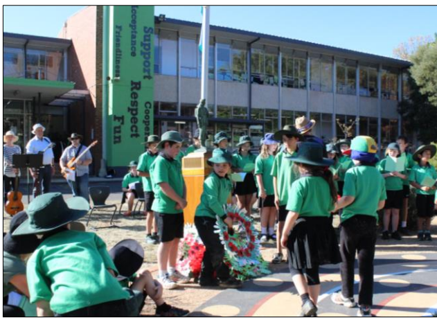
ANZAC Day Assembly in the Indigenous Garden